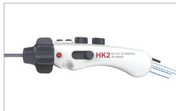
Hand Controlled - Pistol Grip Handle