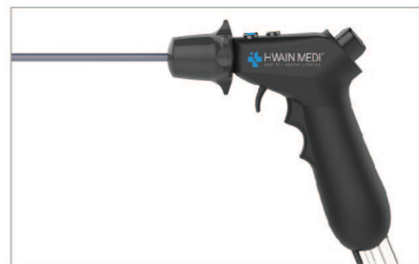
Hand Controlled - Pencil Grip Handle